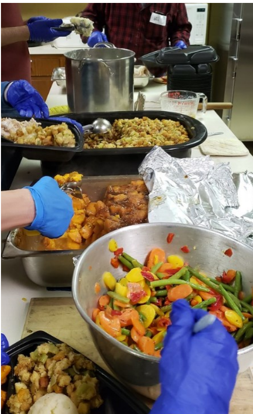
Top: Susan Burack Middle: Ken Steiner Bottom: Volunteers dishing up a traditional holiday meal.