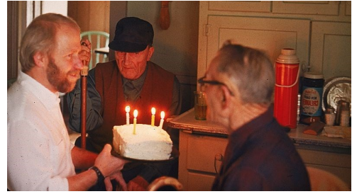
Celebrating a birthday (circa 1982)